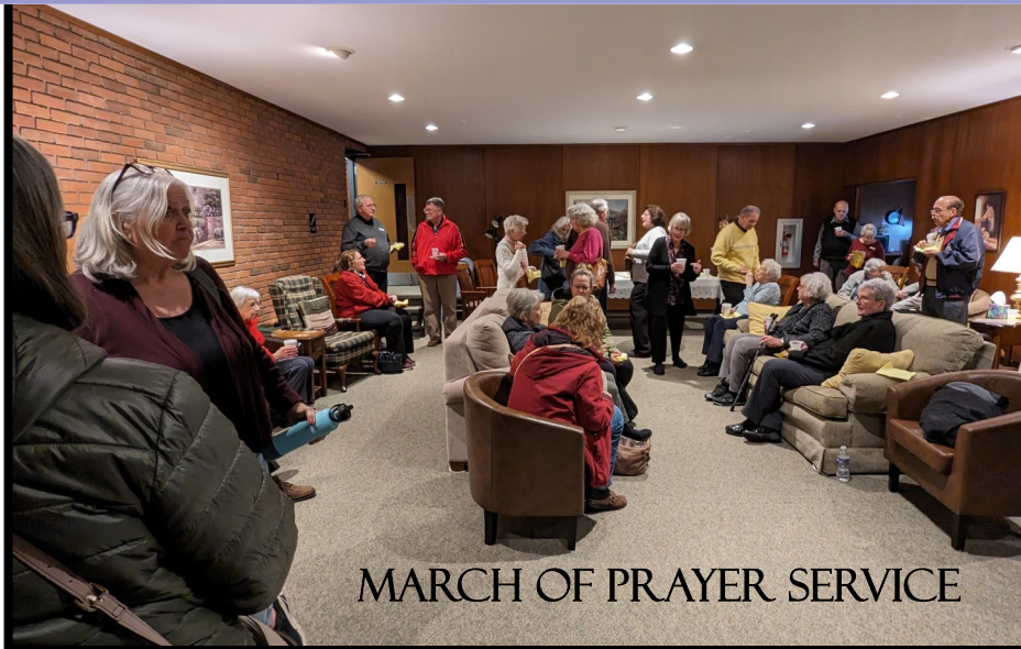
MARCH OF PRAYER SERVICE

*This amount includes: customer charge, infrastructure replacement rider, capital expenditure rider, delivery charge and usage charge. In the early days, the bill was just being paid, but in later years, a budget plan was adopted to spread the cost