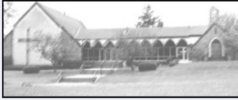
Holy Trinity Lutheran Church